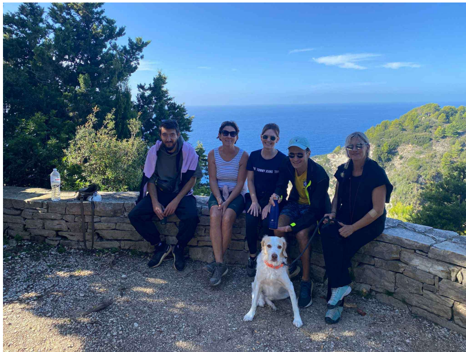
Simpson Travel team fundraising walk to support PAWS

2025 has been a land mark year for our Animal Charity. After 20 years of constant dedicated work towards animal welfare on Paxos our UK team retired and PAWS-UK was shut down. PAWS UK was succeeded by the Greek entity (a nonprofit organization, approved by Corfu courts and registered in the Greek Animal Charities Registration List (5311) supervised by the Greek Ministry of Internal Affairs.