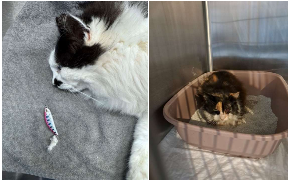
Nony hook free and Perla just before her eye op

Our vet team has dealt with 2 face abscesses, 3 eye e-nucleations, 1 ex ray, 3 dental ops, 2 hook removals, 1 tail infection, free grooming and microchip of a dog, whose owner was financially vulnerable.