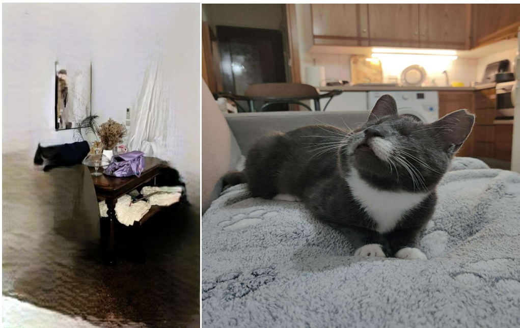
Milou adopted in Corfu and blind Cecil in his new home in Thessaloniki