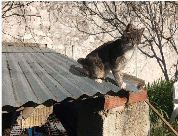
Our lovely Peggy

Visit our website to find out more about them.